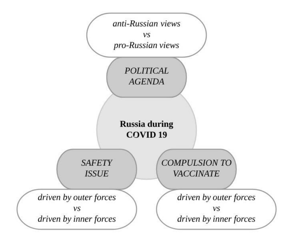
Figure 4. Representation of Russia's Image in English-language mass media during Covid 19