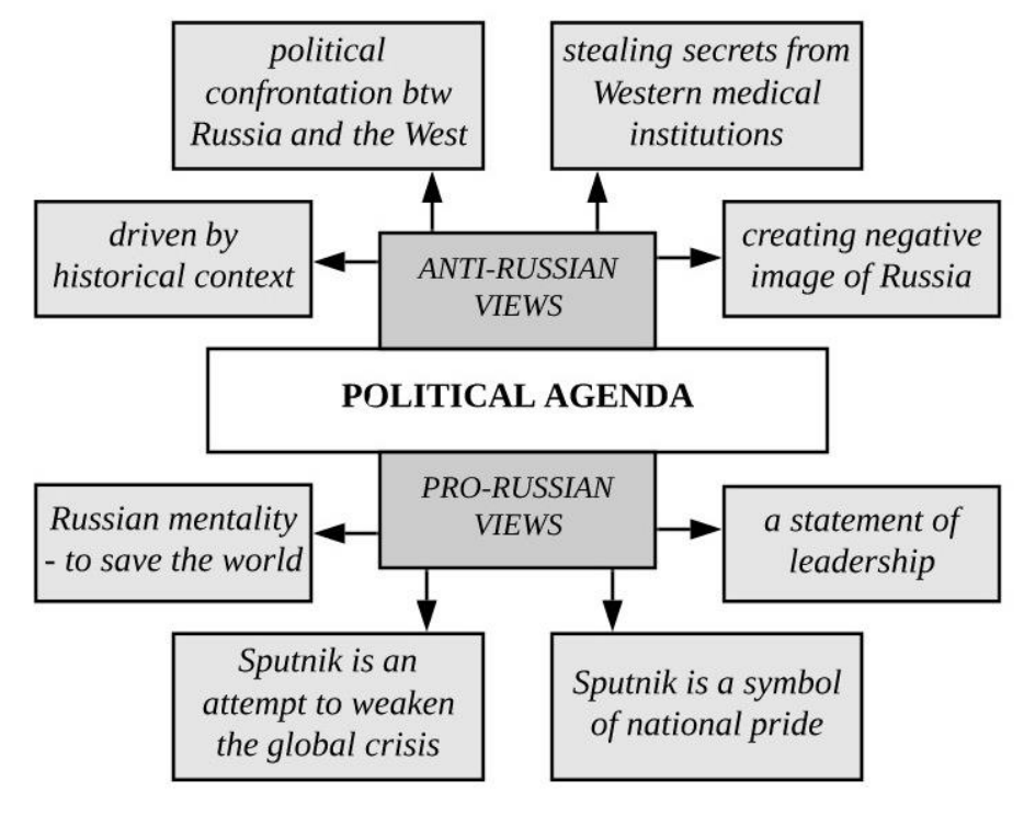
Figure 1. "Political Agenda"